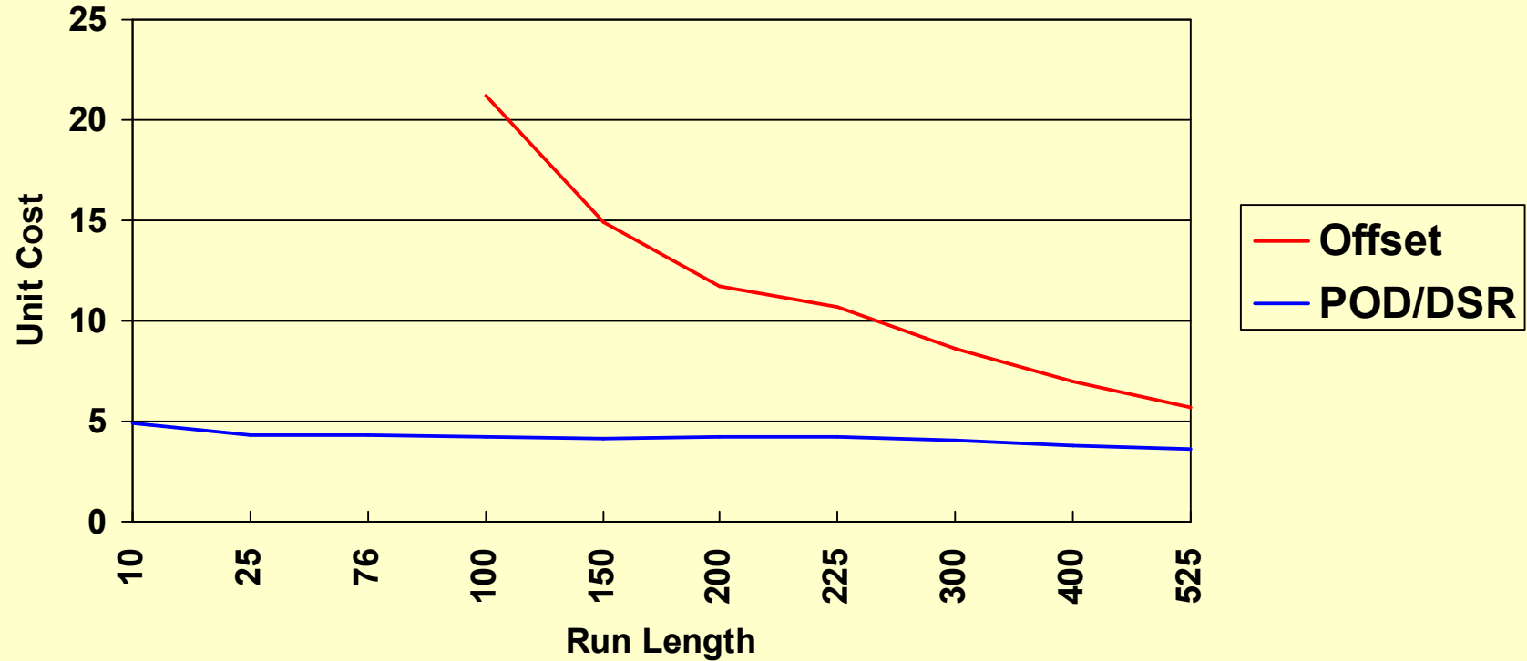
Offset vs. Digital Cost